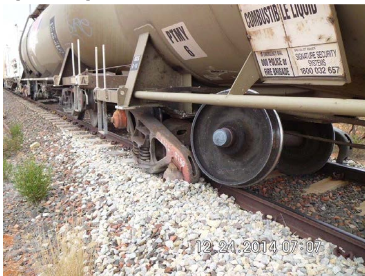
Figure 1: Wagon PTMY 6-T derailed at 1201km