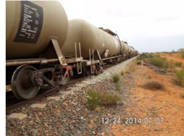
Train 2AD1 near Hugh River, NT